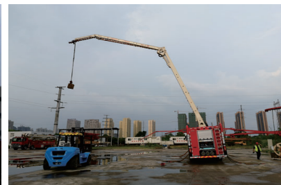
Working stability performance detection