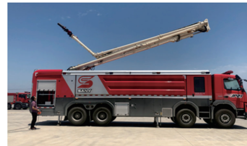
Boom Reliability Test

The unique positive and negative three-folded boom, with working height reaching 21m, working amplitude enhanced by 30% compared with routine boom.