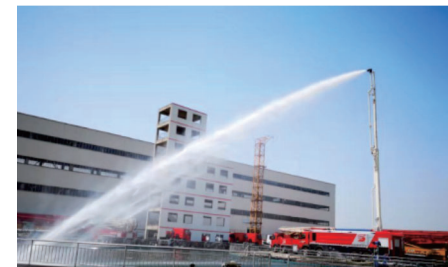
Waterway performance detection

The maximum jetting flow of boom gun is 100L/s, and the maximum firing range of fire control gun can be longer than 85m.